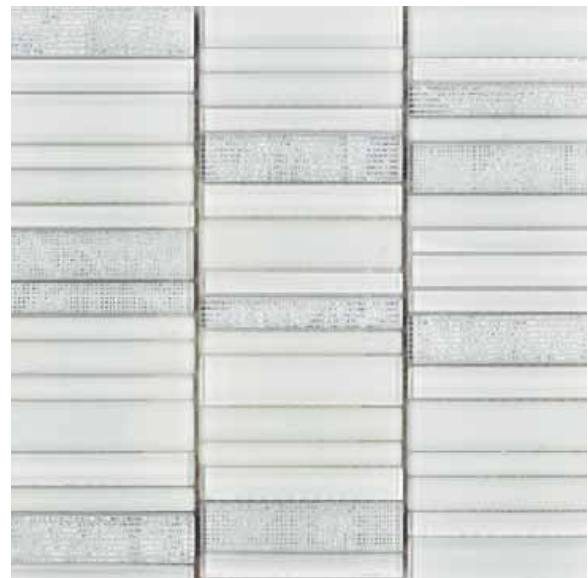
GLACGSWPIXI | pixi mosaic |