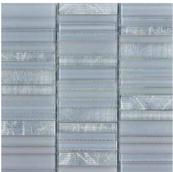
GLACGFOPIXI | pixi mosaic |