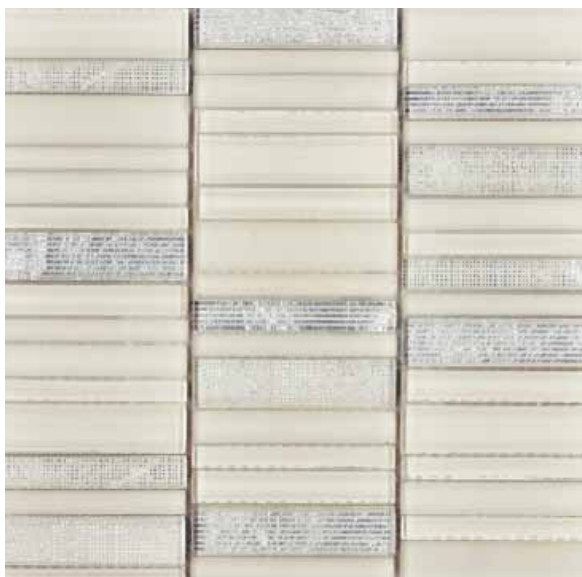
GLACGBIPIXI | pixi mosaic |