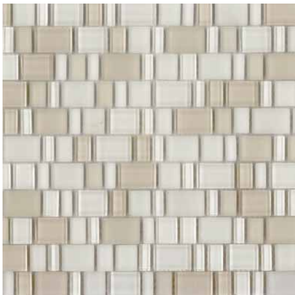
GLACGBIBOND | bond mosaic |