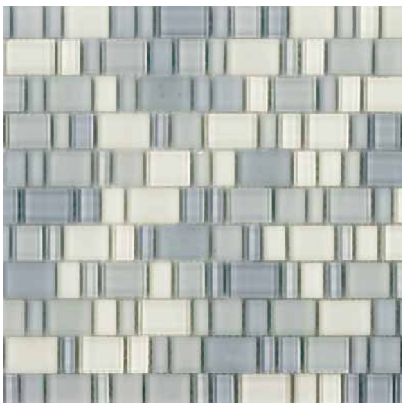
GLACGFOBOND | bond mosaic |