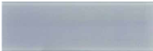
GLACGFO412 | 4 x 12 |