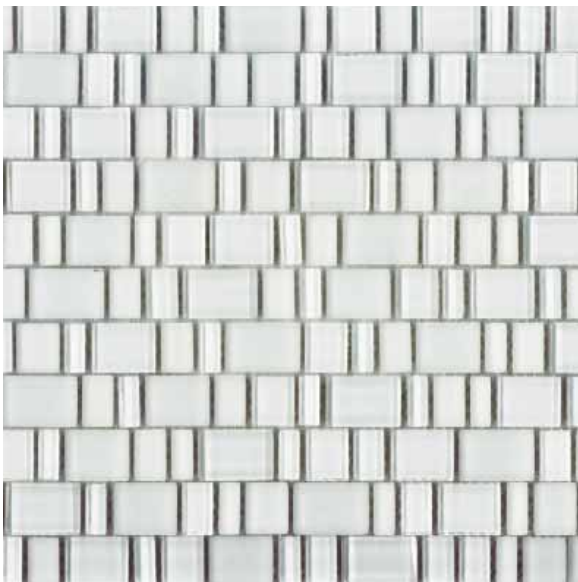
GLACGSWBOND | bond mosaic |