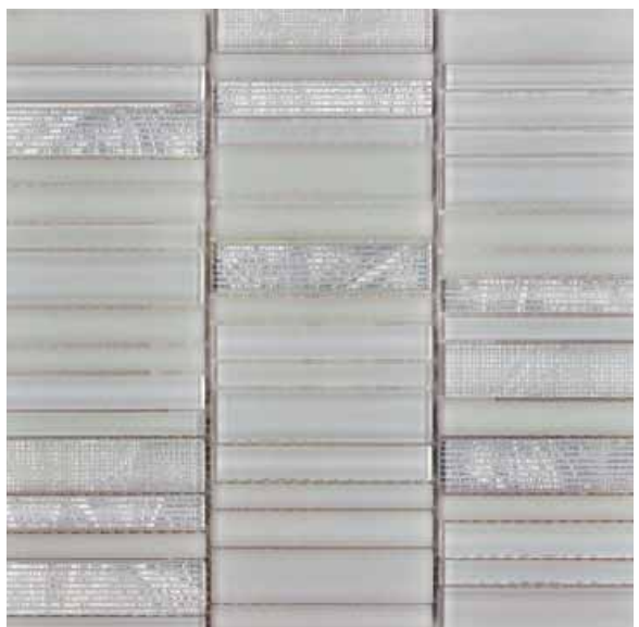
GLACGCLPIXI | pixi mosaic |