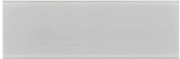
GLACGCL412 | 4 x 12 |