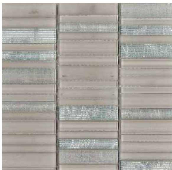
GLACGGGPIXI | pixi mosaic |