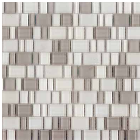
GLACGGGBOND | bond mosaic |