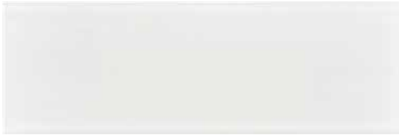
GLACGSW412 | 4 x 12 |