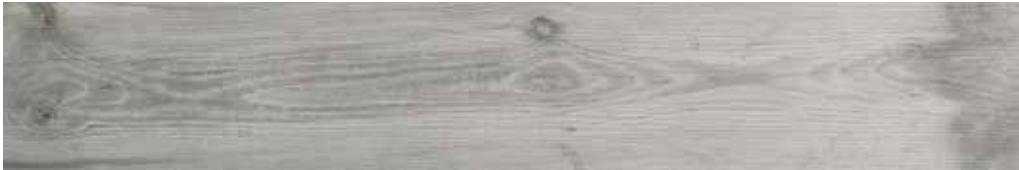
| 8x48 |