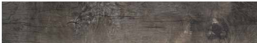
| 8x48 |