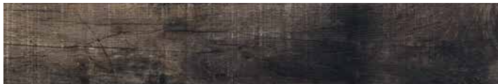
| 8x48 |