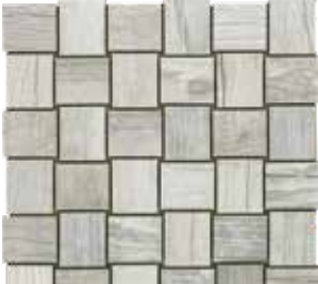
| Intermix Mosaic |