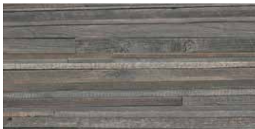
| 12x24 |