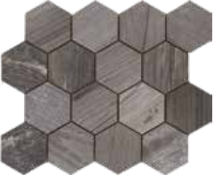
| 3" Hexagon Mosaic |