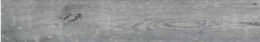
| 8x48 |