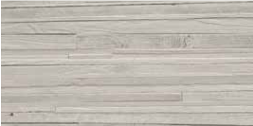
| 12x24 |