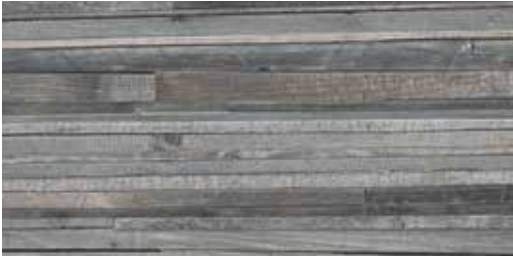
| 12x24 |