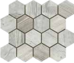
| 3" Hexagon Mosaic |