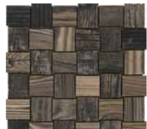
| Intermix Mosaic |