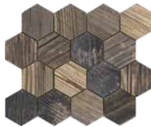
| 3" Hexagon Mosaic |