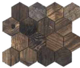
| 3" Hexagon Mosaic |