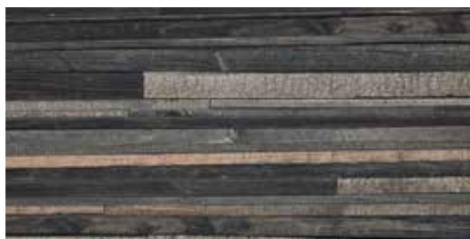
| 12x24 |