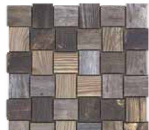
| Intermix Mosaic |