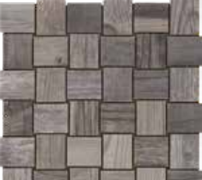
| Intermix Mosaic |